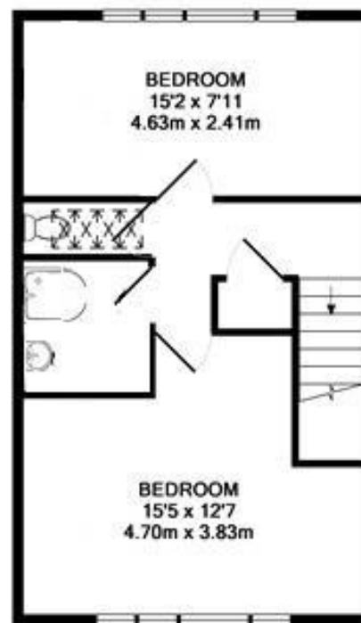
1ST FLOOR APPROX. FLOOR AREA 38.0 SQ.M. (409 SQ.FT.)

BRINSWORTH CLOSE, TWICKENHAM, TW2 5BS TOTAL APPROX. FLOOR AREA 76.0 SQ.M. (819 SQ.FT.)