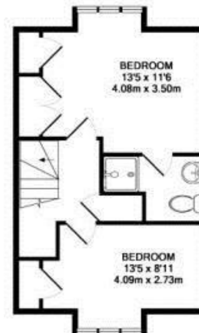
2ND FLOOR APPROX. FLOOR AREA 381 SQ. FT. (35.4 SQ. M.)

BUSHY PARK ROAD, TW11 TOTAL APPROX. FLOOR AREA 1416 SQ. FT. (131.5 SQ. M.)