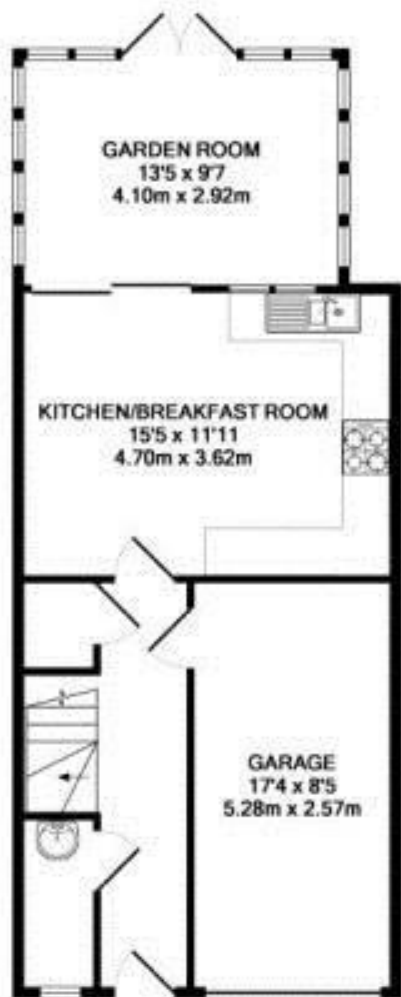
GROUND FLOOR APPROX. FLOOR AREA 583 SQ. FT. (54.1 SQ. M.)