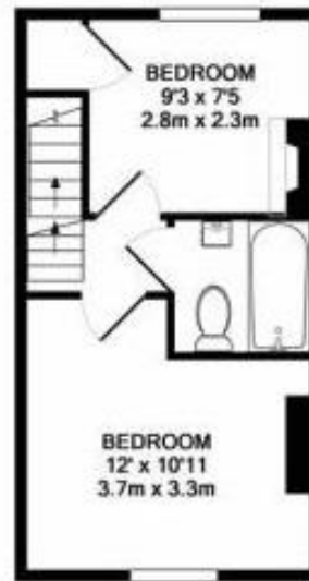
1ST FLOOR APPROX. FLOOR AREA 261 SQ.FT. (24.3 SQ.M.)