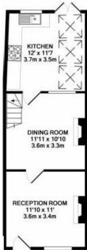
GROUND FLOOR APPROX. FLOOR AREA 489 SQ.FT. (45.4 SQ.M.)

ALBION ROAD TOTAL APPROX FLOOR AREA 750 Sq Ft (69.6 Sq M) 861 Sq Ft (80.0 Sq M) including Loft Room