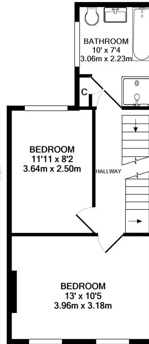
1ST FLOOR APPROX. FLOOR AREA 387 SQ.FT. (36.0 SQ.M.)