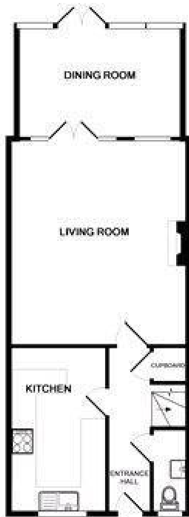
GROUND FLOOR APPROX. FLOOR AREA 53.9 SQ.M (581 SQ.FT.)