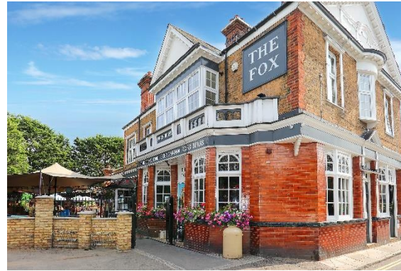
The popular Fox Pub is within easy walking distance

Whilst every attempt has been made to ensure the accuracy of the floorplan contained here, measurements of doors, windows, rooms and any other items are approximate and no responsibility is taken for any error, omission or mis-statement. This plan is for illustrative purposes only and should be used as such by any prospective purchaser. The services, systems and appliances shown have not been tested and no guarantee as to their operability or efficiency can be given. Made with Metropix ©2021