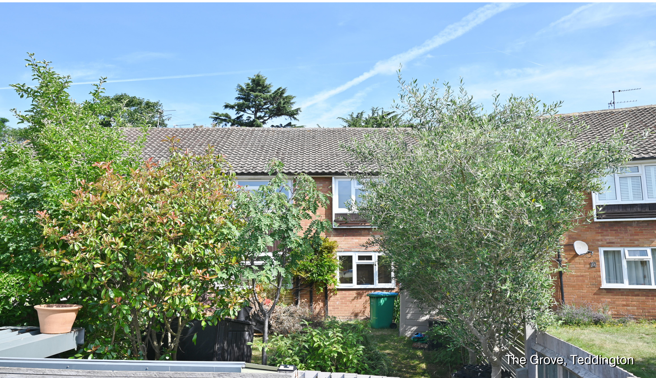
The Grove, Teddington